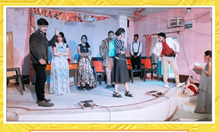
Drama Performed by Students