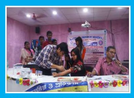
Thalassemia Detection (NSS)