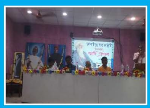
Rabindra Jayanti Celebration