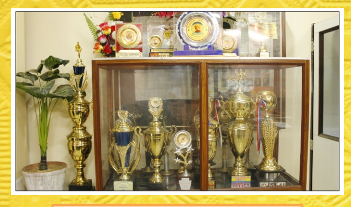
Prizes won by Students