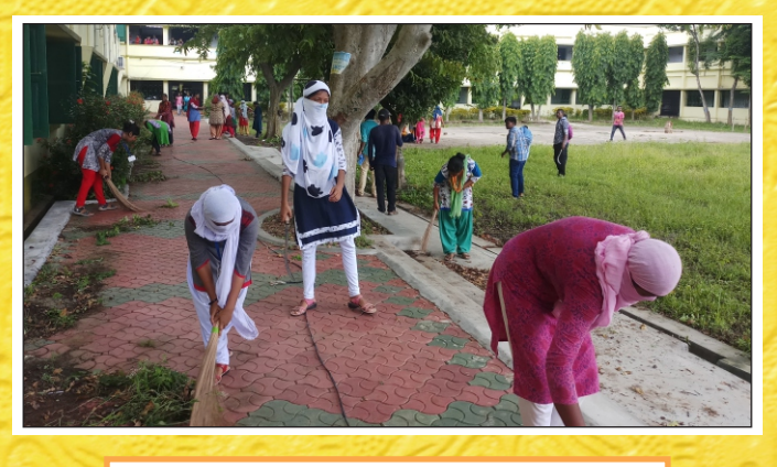
Campus Cleaning (NSS)