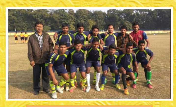
College Football Team