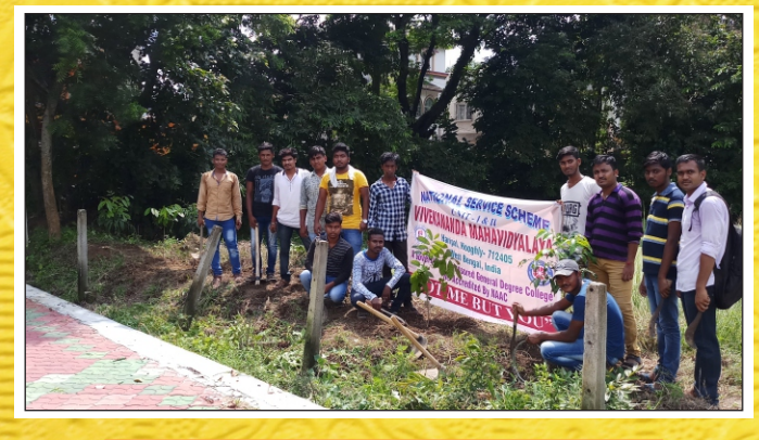
Plantation Programme (NSS)