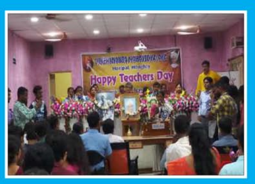
Teachers' Day Celebration