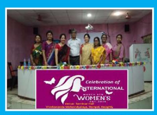
Womens' Day Celebration