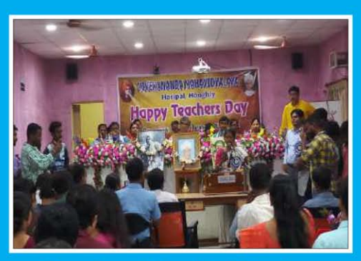
Teachers' Day Celebration