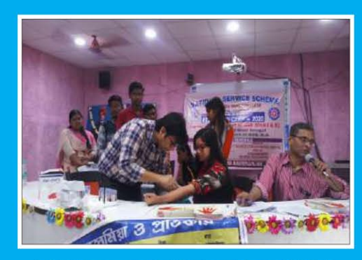
Thalassemia Detection (NSS)