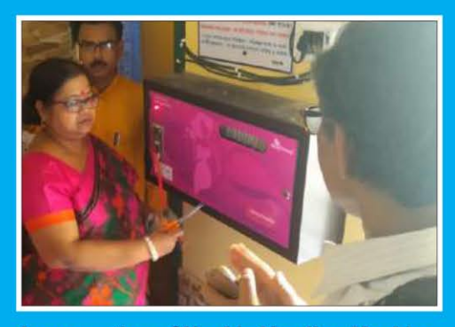
Inauguration of Napkin Vending Machine