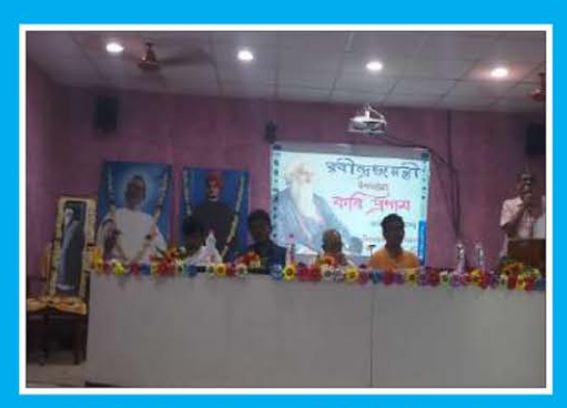
Rabindra Jayanti Celebration