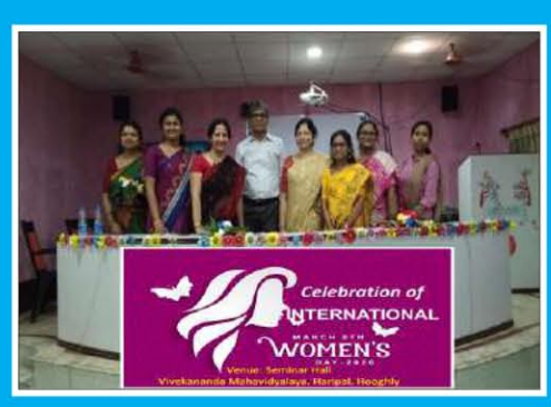
Womens' Day Celebration