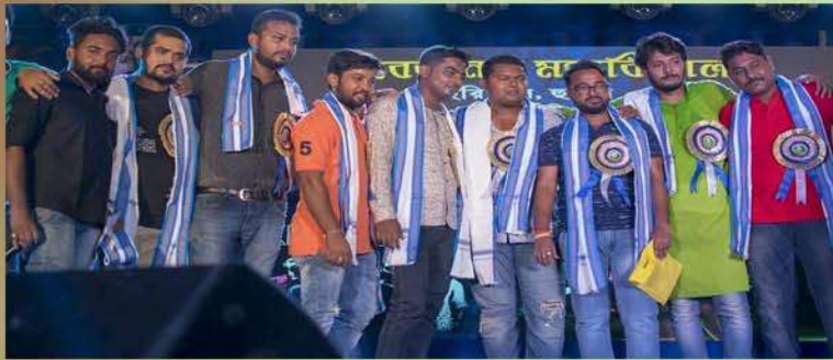
Freshers' Welcome and Annual Festival - 2022