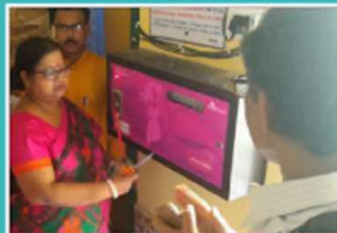
Inauguration of Sanitary Napkin Vending Machine