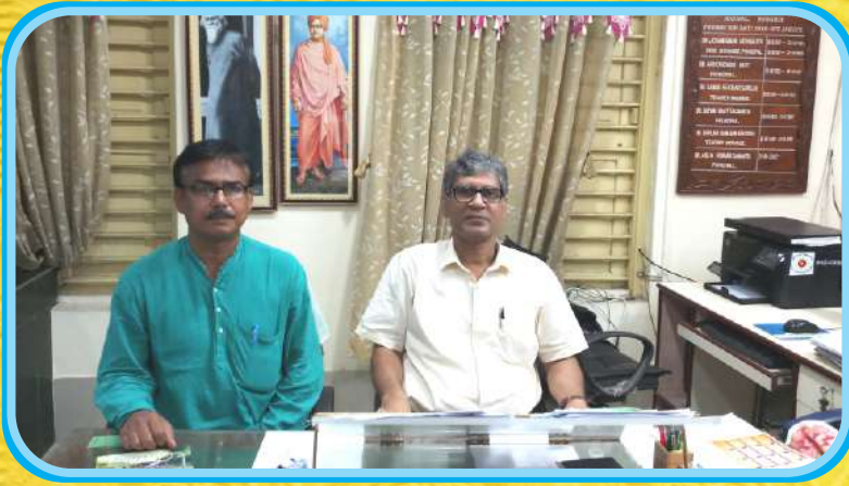
Principal with President