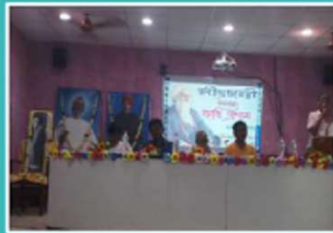
Rabindra Jayanti Celebration