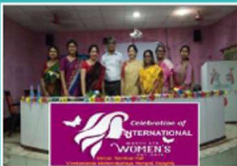
Women's Day Celebration