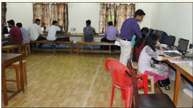
Comp. Sc. Laboratory