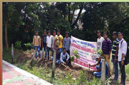
Tree Plantation (NSS)