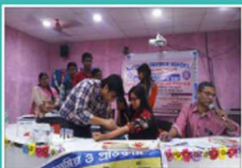
Thalassemia Awareness Camp (NSS)