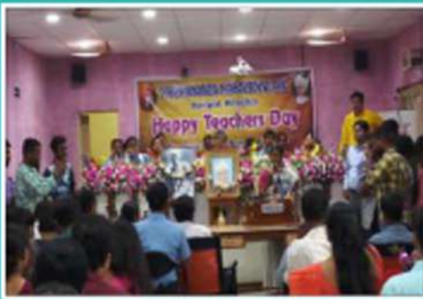
Teacher's Day Celebration