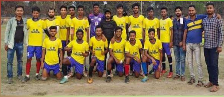
College Football Team and University Champion