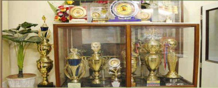
Trophies Won by Students