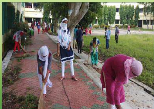
Campus Cleaning (NSS)