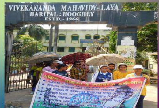
Awareness Camp (NSS)